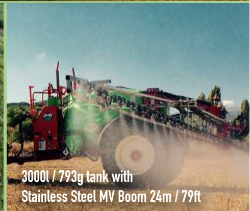
3000l / 793g tank with Stainless Steel MV Boom 24m / 79ft