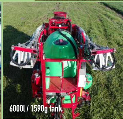
6000l / 1590g tank