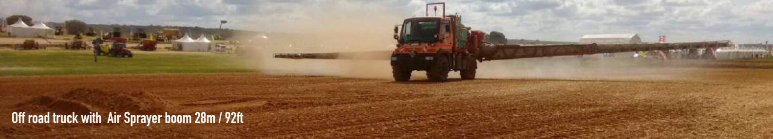
Off road truck with Air Sprayer boom 28m / 92ft