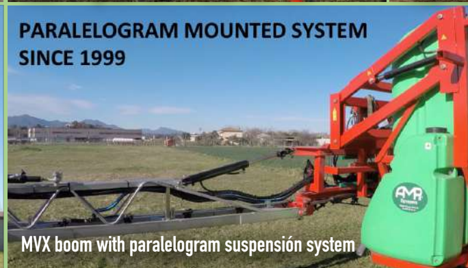
PARALELOGRAM MOUNTED SYSTEM SINCE 1999