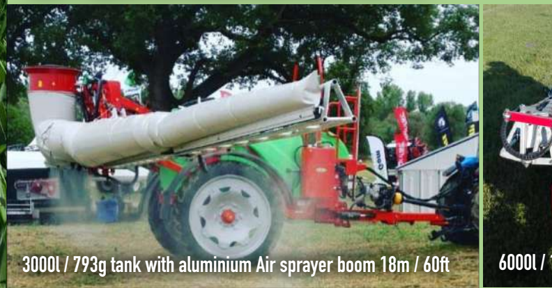
3000l / 793g tank with aluminium Air sprayer boom 18m / 60ft