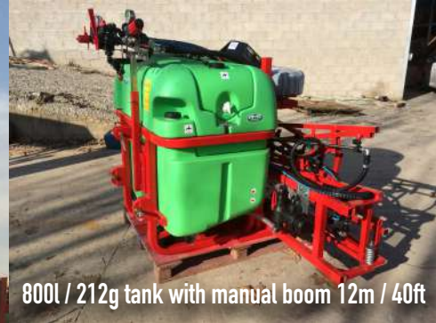
800l / 212g tank with manual boom 12m / 40ft

PUMP Diaphragm 25 to 300 l/min Diaphragm 6 to 80 g/min Centrifugal 4000/min Centrifugal 106 g/min