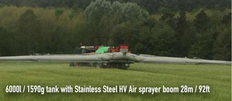
6000l / 1590g tank with Stainless Steel HV Air sprayer boom 28m / 92ft