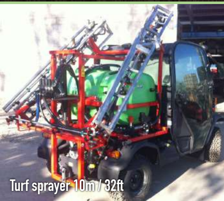
Turf sprayer 10m / 32ft