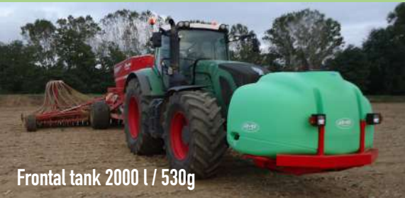
Frontal tank 2000 l / 530g