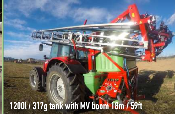
1200l / 317g tank with MV boom 18m / 59ft