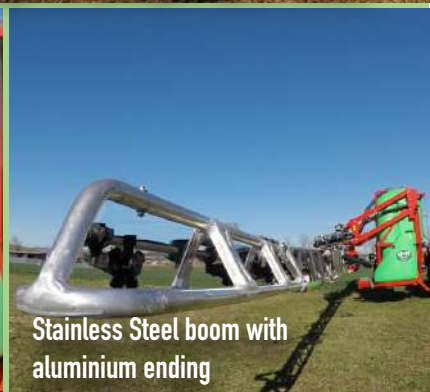
Stainless Steel boom with aluminium ending