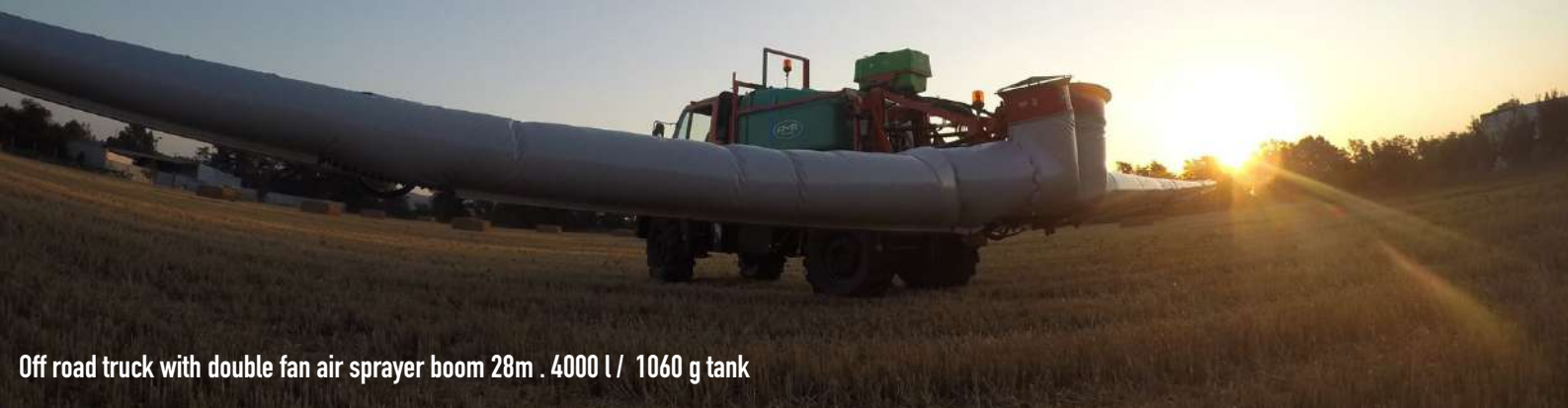
Off road truck with double fan air sprayer boom 28m . 4000 l / 1060 g tank