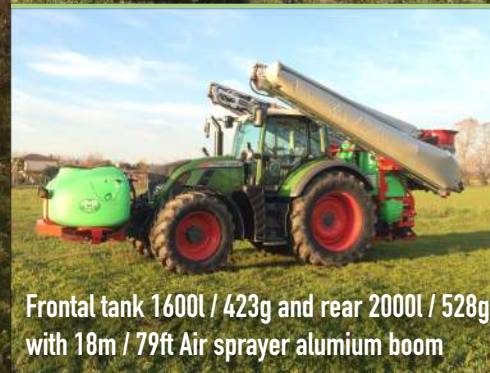
Frontal tank 1600l / 423g and rear 2000l / 528g with 18m / 79ft Air sprayer aluminium boom