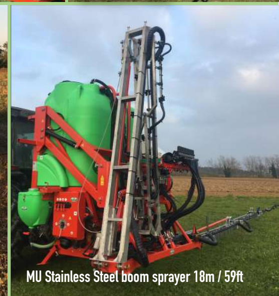
MU Stainless Steel boom sprayer 18m / 59ft