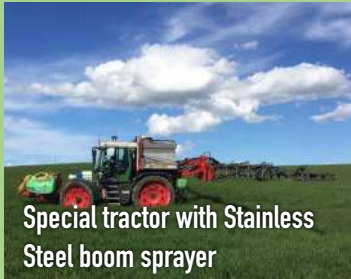
Special tractor with Stainless Steel boom sprayer