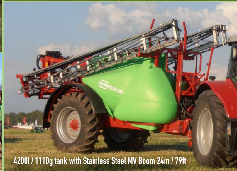
4200l / 1110g tank with Stainless Steel MV Boom 24m / 79ft