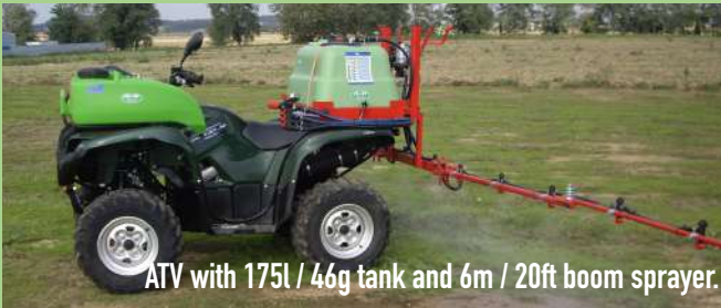
ATV with 175l / 46g tank and 6m / 20ft boom sprayer.