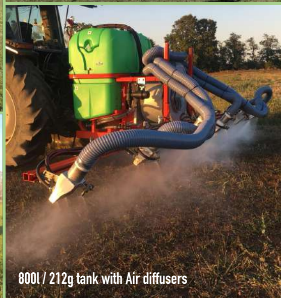
800l / 212g tank with Air diffusers