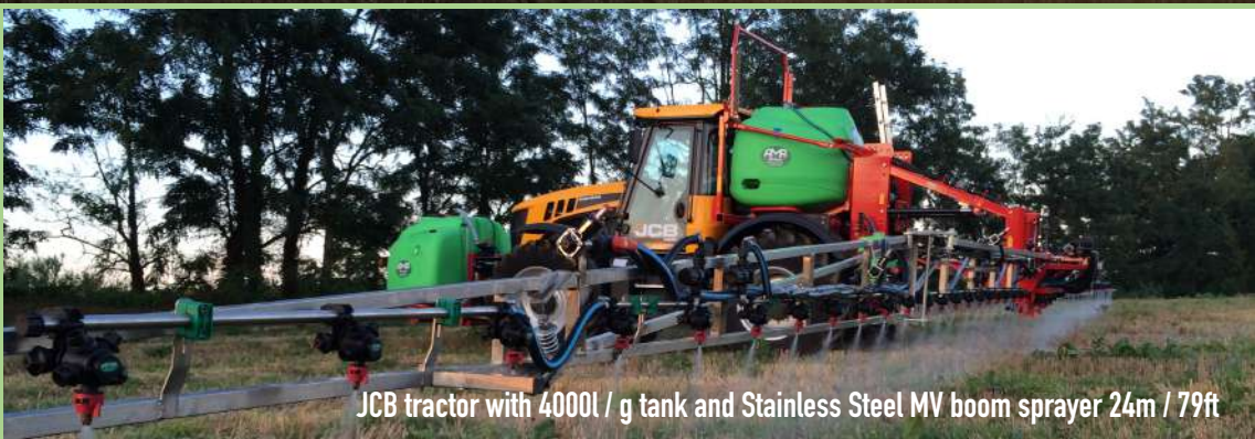
JCB tractor with 4000l / g tank and Stainless Steel MV boom sprayer 24m / 79ft