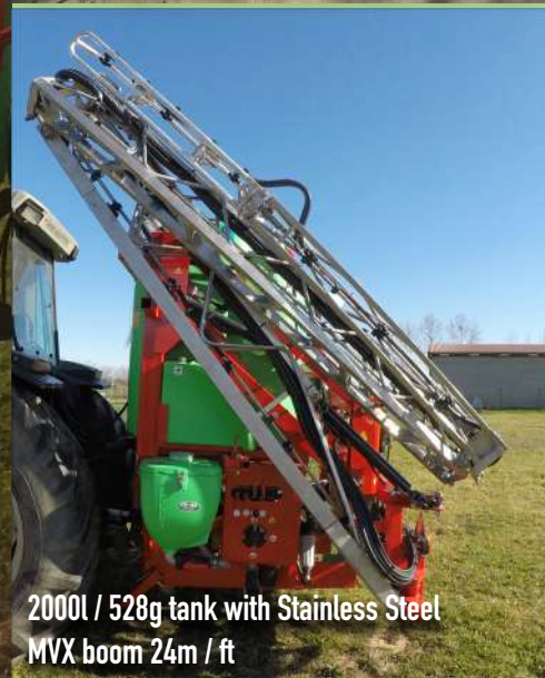
2000l / 528g tank with Stainless Steel MVX boom 24m / ft