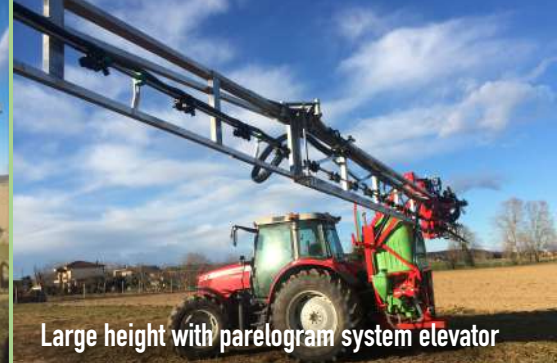
Large height with paralelogram system elevator